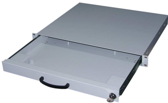
Photo shows keyboard-drawer equip 260410