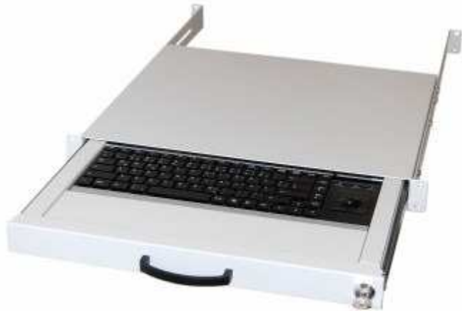
Photo shows keyboard-drawer equip 260611 with optional mounting rails equip 260910